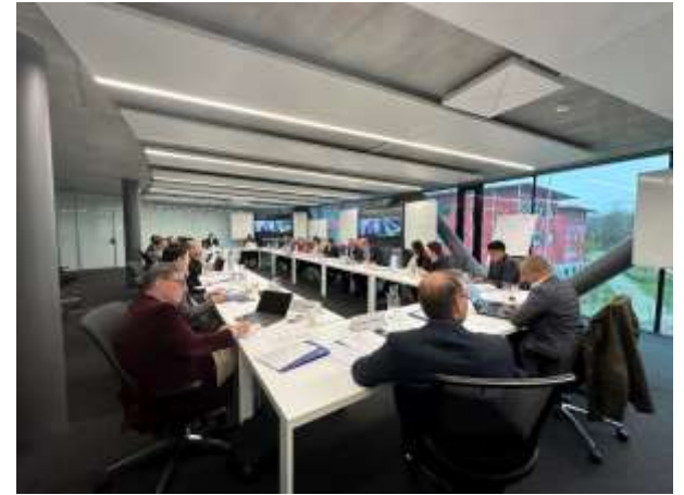
P5 Roundtable in Geneva