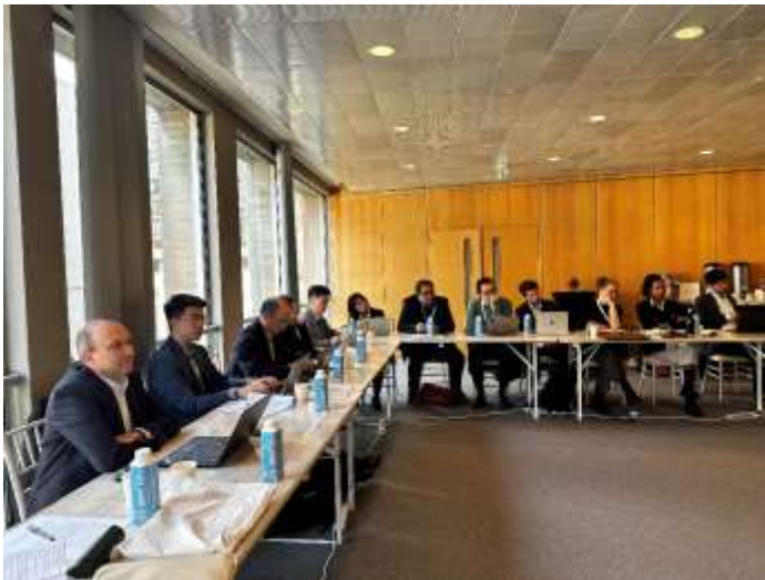
Convergence Workshop at UNESCO in Paris