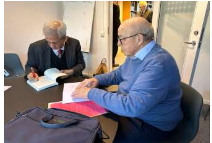
Joint presentation of book with Hans Blix, former Director General of IAEA