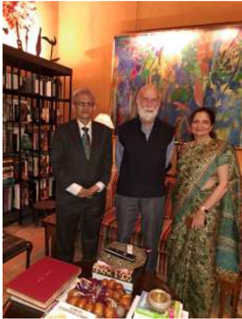
Discussion with HRH Prince Michael of Kent