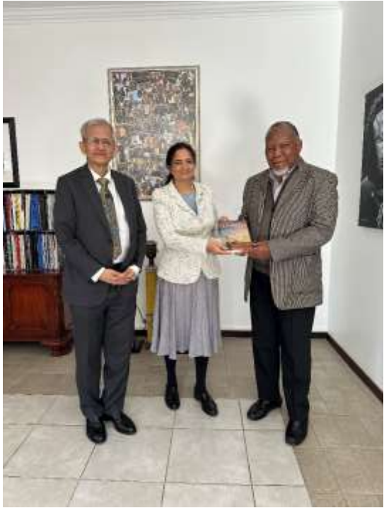
Discussion with Kgalema Motlanthe, former President of South Africa