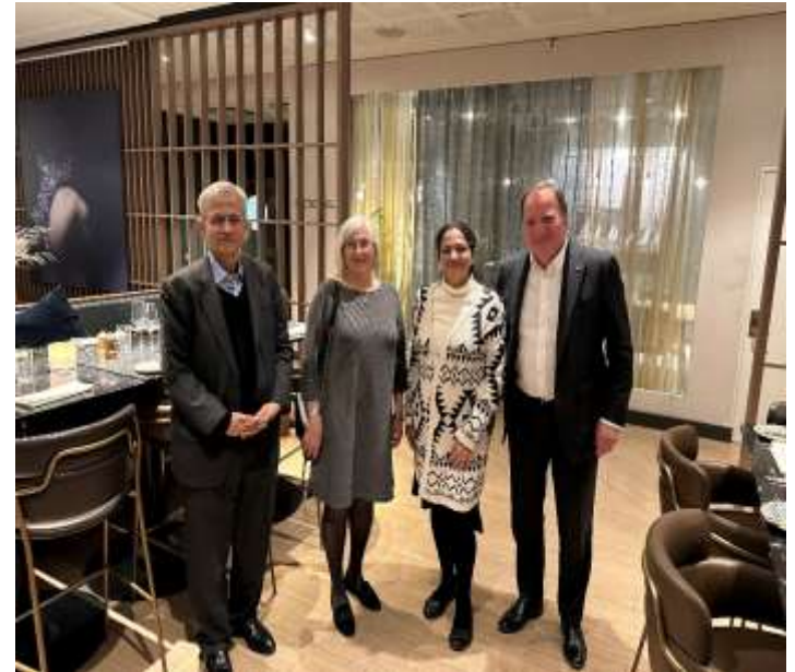
Discussion with Stefan Löfven, former Prime Minister of Sweden