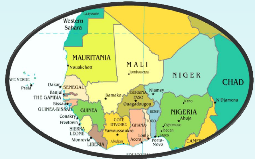
Volta Basin Authority Ouagadougou, BF